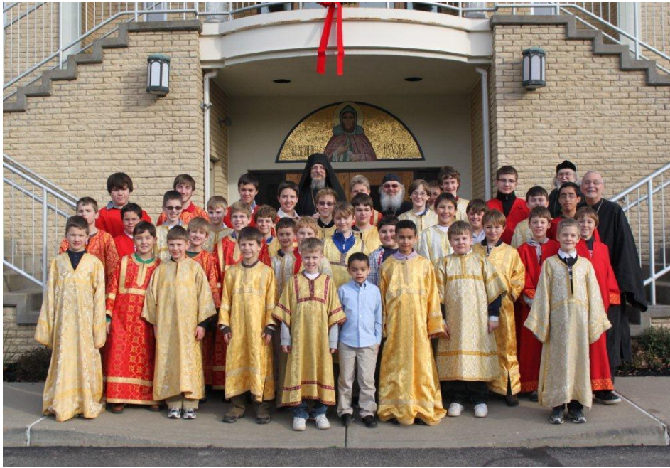
Altar Servers at the Retreat on Saturday December 3, 2010